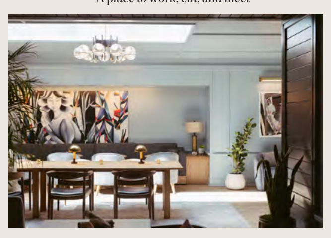
The Parlor For getting lost in conversation over cocktails