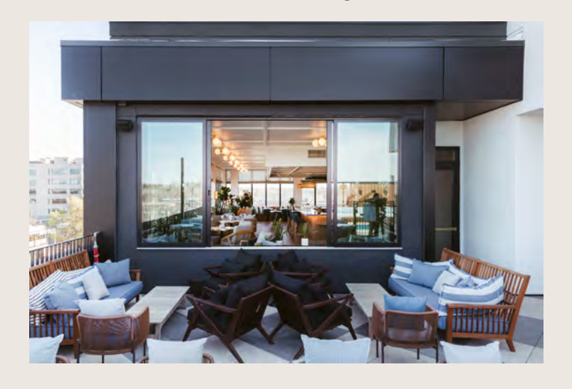
The Rooftop Patio Unwind with stunning views